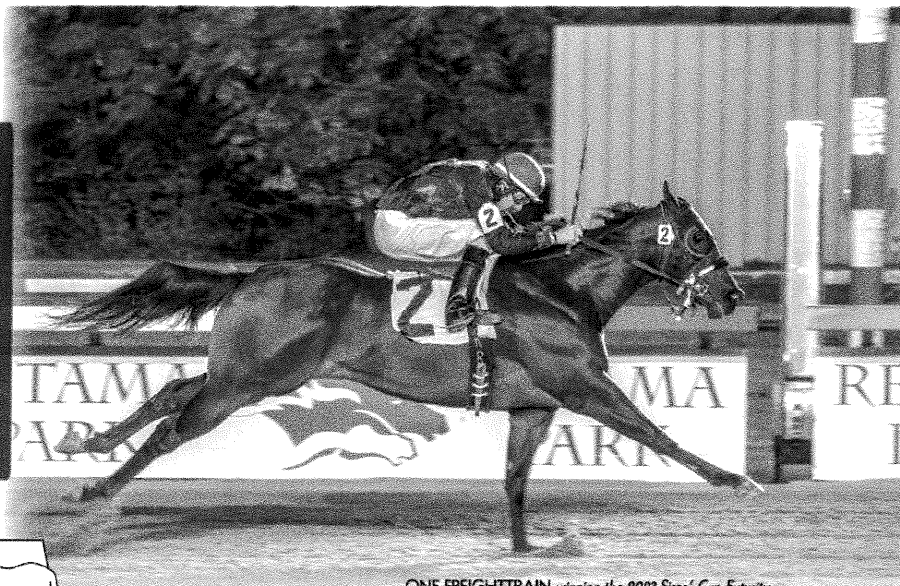
ONE FREIGHTTRAIN winning the 2023 Sires' Cup Futurity

$5,000 (plus all fees) Supplemental Fee due at time of entry - paid at Retama Park