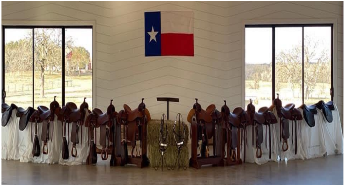
Awards From the 2020 TQHA Saddle Series